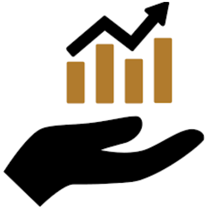
existing financial products